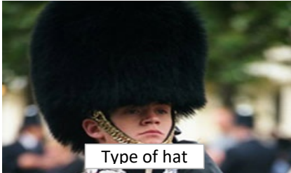
Type of hat