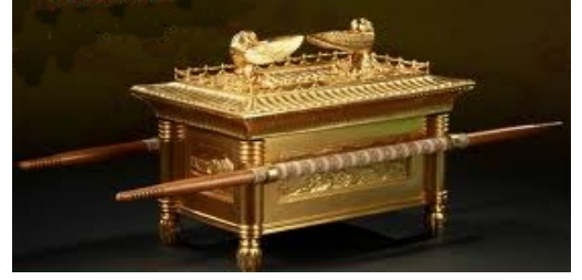
ARK OF THE COVENANT